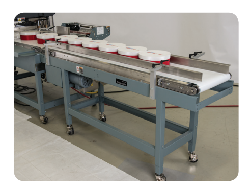
72" Product Separating Infeed