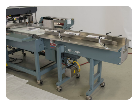
Adjustable Flight Lug Infeed