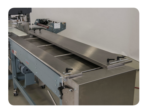
Adjustable Flight Bar Infeed